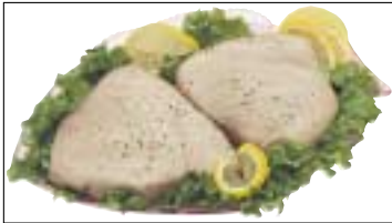
133 Tuna Steaks