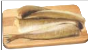
137 Whitting Fish