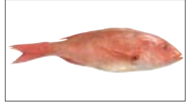
132 True Snapper