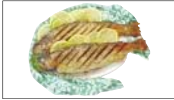
128 Trout Cooked