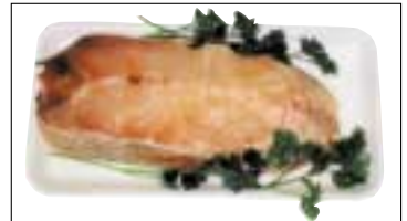
138 Yellow Eye Steak