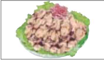
127 Top Shell Meat