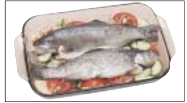
129 Trout Baked