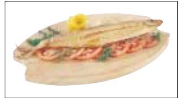
135 White Fish