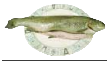
131 Trout, Rainbow