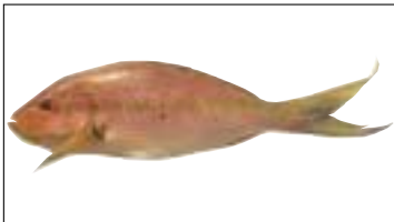
139 Yellow Tail