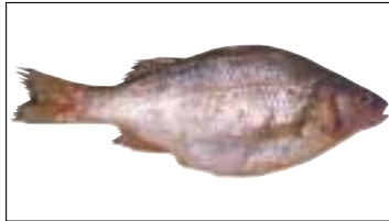
134 White Fish