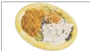
47 Fillet, Scord