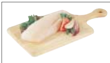
41 Fillet, Cod