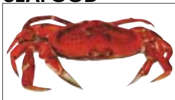
37 Crab, Red