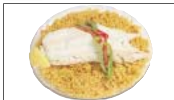
48 Fillet, Scord