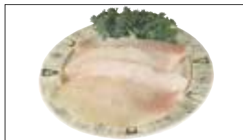
42 Fillet, Dover Sole