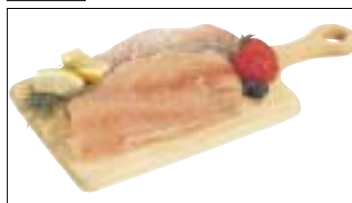
45 Fillet, Red Snapper