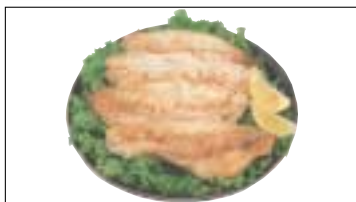
46 Fillet, Red Snapper