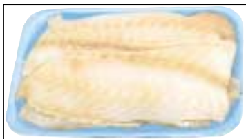
40 Fillet White