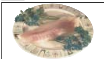
43 Fillet, Perch