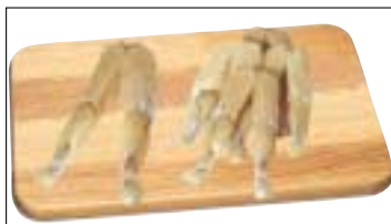
53 Frog Leg