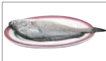
54 Gasper Goo