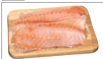
44 Fillet, Red Snapper