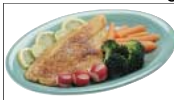
39 Fillet Cooked