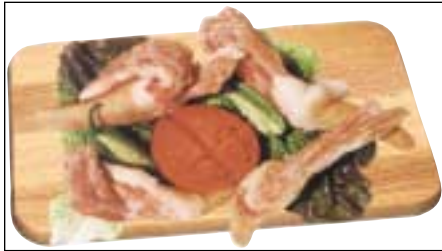
40 Pig Tail