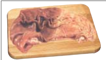
43 Pork Buche