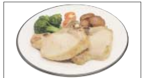
51 Pork Chops, Center Cut Cooked