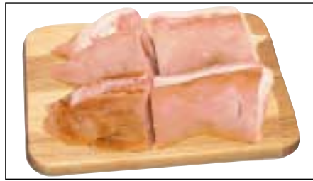
38 Pig Feet