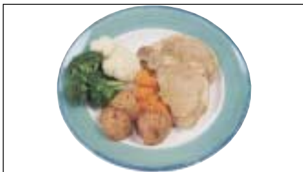
49 Pork Chops, Center Cut Cooked