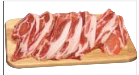
45 Pork Chops