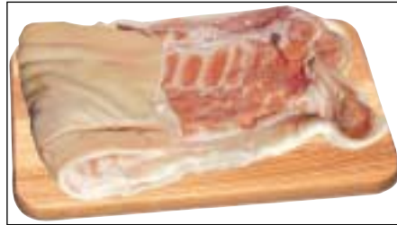
41 Pork Bellies