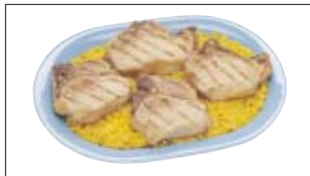
50 Pork Chops, Center Cut Cooked