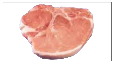
54 Pork Chops, Loin