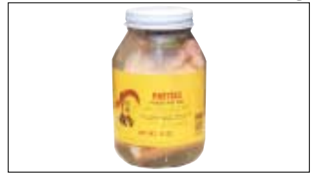
39 Pig Feet(Patitas) 15 oz