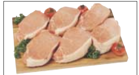
48 Pork Chops, Center Cut