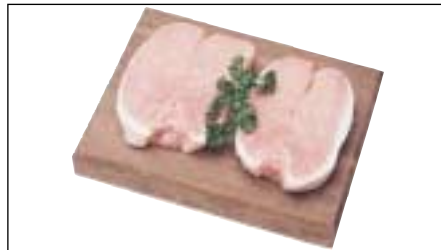
47 Pork Chops, Butterfly