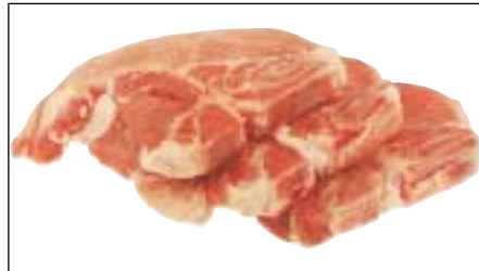
44 Pork Chops