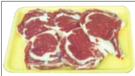
46 Pork Chops