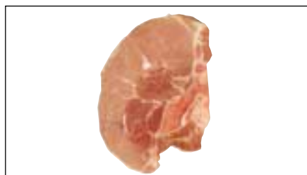
53 Pork Chops, End Cut Loin