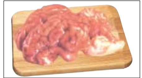
42 Pork Brain