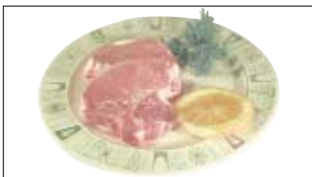
52 Pork Chops, Center Cut