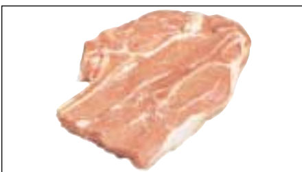
196 Veal Steak, Shoulder Blade