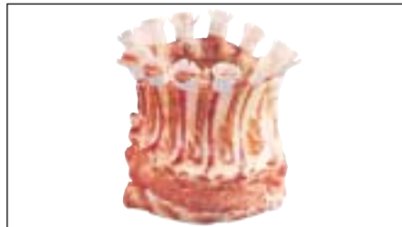
191 Veal Roast, Crown