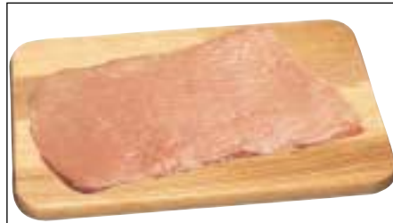
188 Veal Leg Cutlet