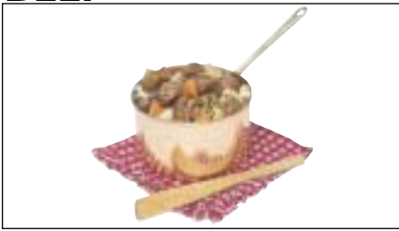
181 Stew Meat Cooked