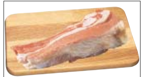
189 Veal Riblet