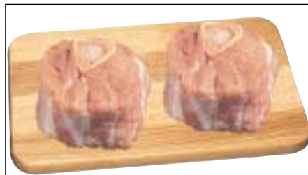
194 Veal Shank