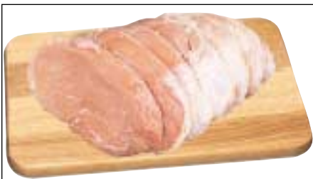
193 Veal Roast, Shoulder Arm