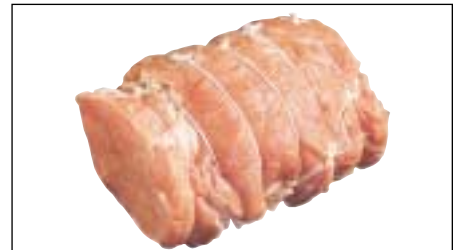
192 Veal Roast