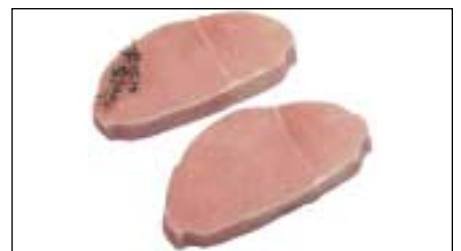
198 Veal Cutlet