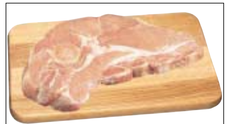
195 Veal Steak, Shoulder