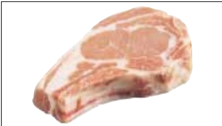
187 Veal Chop, Rib