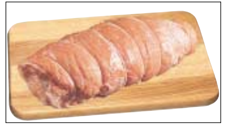
183 Veal Breast Rolled