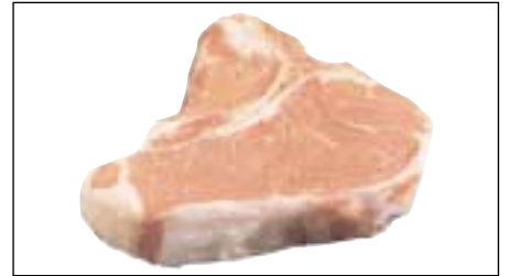
186 Veal Chop, Loin