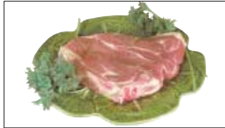
185 Veal Chop