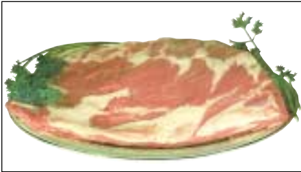
184 Veal Breast Boneless