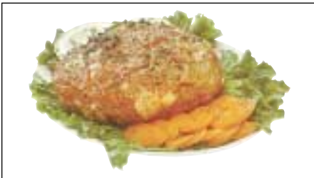
190 Veal Roast