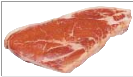
110 Steak, Chuck Boneless