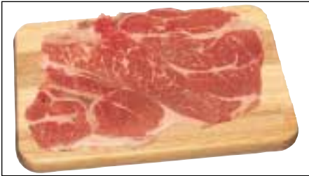
112 Steak, Chuck