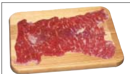
125 Steak, Flap Meat