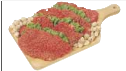
116 Steak, Cubed