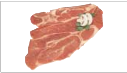
109 Steak, Chuck 7-Bone