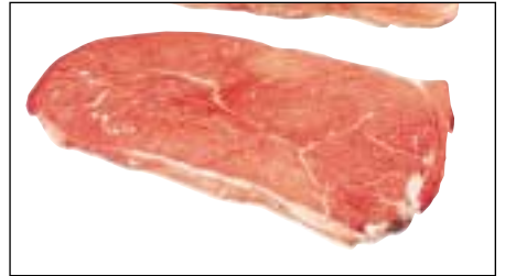
114 Steak, Chuck Shoulder