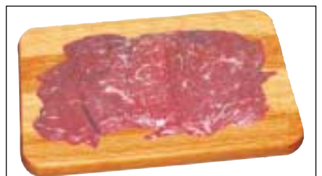
126 Steak, Flap Meat