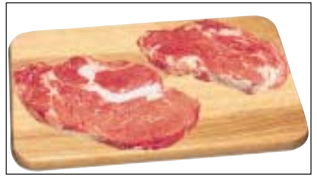
111 Steak, Chuck Eye