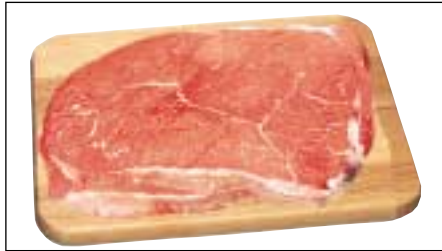
113 Steak, Chuck Shoulder