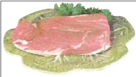
115 Steak, Chuck Boneless