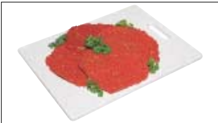
118 Steak, Cubed