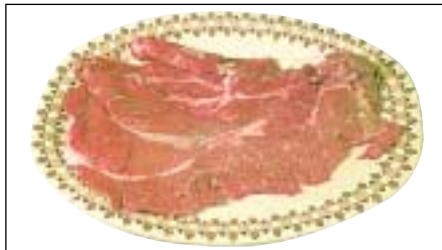
119 Steak, Diesmillo