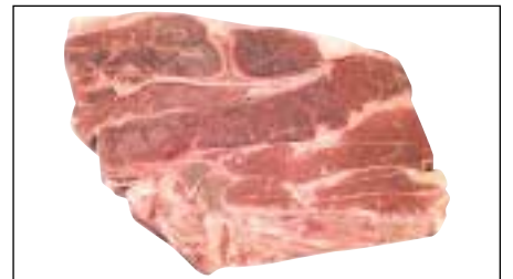
63 Roast, 7-Bone