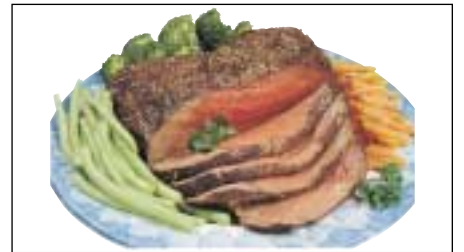
66 Roast, Bottom