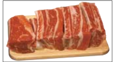
60 Ribs, Short