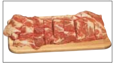
57 Ribs, Country style