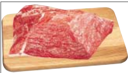
67 Roast, Bottom Round