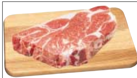
62 Roast, 7-Bone Pot