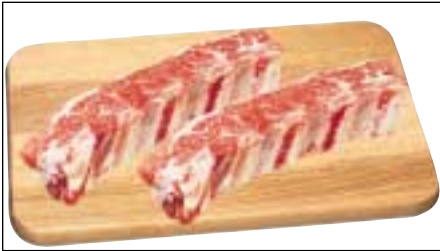
58 Ribs, Flanken Style