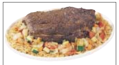
72 Roast, Chuck Cooked