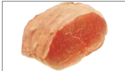
65 Roast, Boneless