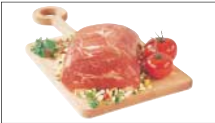
64 Roast, Blade