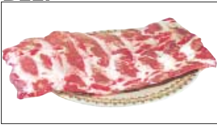
55 Ribs, Back