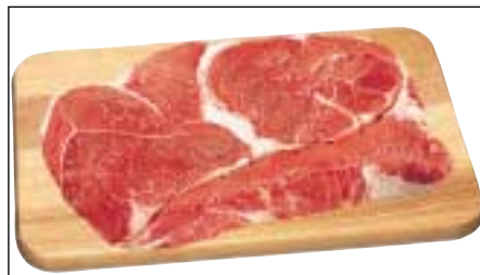
68 Roast, Chuck