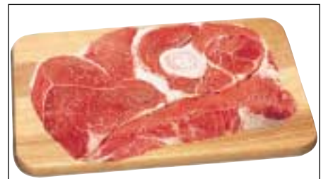
69 Roast, Chuck Arm Pot