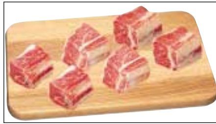
56 Ribs, Chuck Short