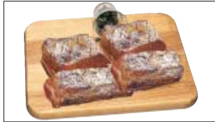
59 Ribs, Short