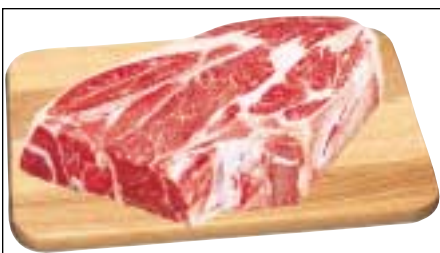
70 Roast, Chuck Blade